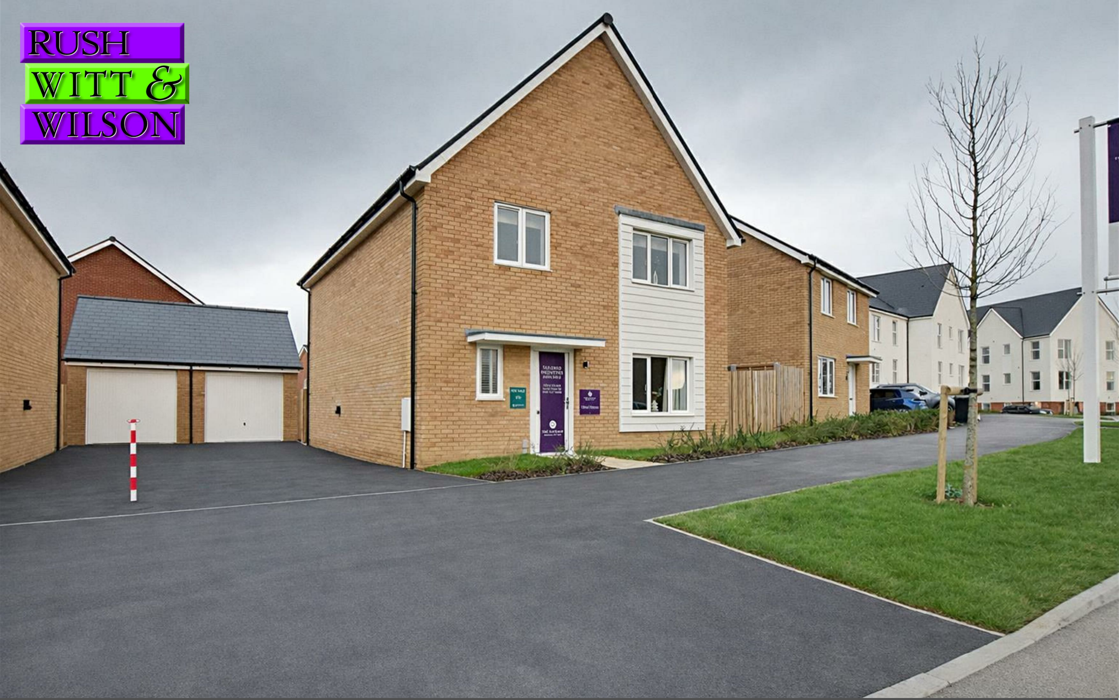
Plot 427 The Gateway, Bexhill-on-Sea, East Sussex TN40 2GA £145,499 Leasehold